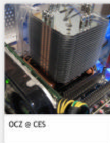
OCZ @ CES

As OCZ gears up for another great year, the 2007 Consumer Electronics Show was the perfect opportunity to reveal what we have in store for overclockers, enthusiasts, and gamers. Adding to our enthusiast cooling product line, OCZ showcased the Vindicator CPU cooler and the unique "silver array" CPU water block. For the performance-minded gamer who seeks every bit of extra edge over competitors, OCZ showed off their impending Equalizer mouse which features the OCZ "Triple Threat" button. As an innovator in the flash market, OCZ exposed their new Trifecta memory card, a total flash solution that features Micro SD, SD, and USB-readiness in one unit. Perhaps the most stunning product present at the OCZ suite was the robust 2000W power supply!