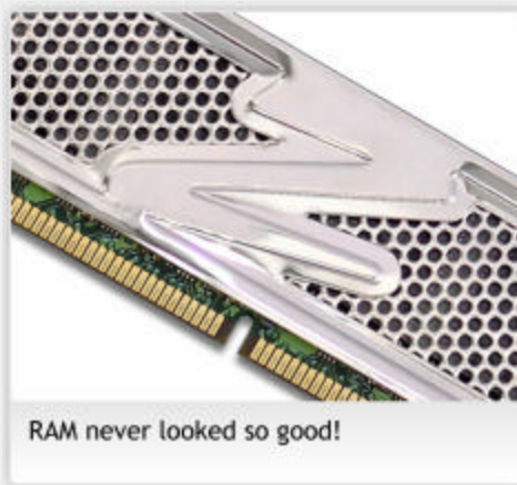
RAM never looked so good!

OCZ adds fuel to your fire with the new OCZ DDR2-1000 series! Released last month just in time for CeBIT, the two new 1GHz parts were added to the renowned OCZ Platinum series. Rated at CL 4-5-4, the PC2-8000 Platinum Extreme Edition is the World's first reduced latency 1GHz memory product. OCZ Technology, upholding a legacy of innovation and commitment to the enthusiast, developed the new PC2-8000 Platinum XTC series to advance next generation platforms to the next performance level, ensuring enthusiasts are not restricted by the limitations of their memory. No other company offers CAS 4 latency at 1GHz, making these ground-breaking modules the industry's fastest memory.