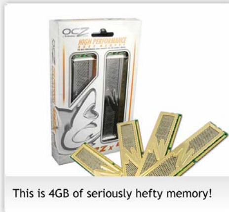
This is 4GB of seriously hefty memory!

This is 4GB of seriously hefty memory! These optimized kits offer users the option of getting the high speeds and high capacities needed for their demanding gaming PC and Vista-upgraded desktops in a unique 4 x 1GB solution. Play with a full tank of memory with these gold and platinum memory modules in your rig.