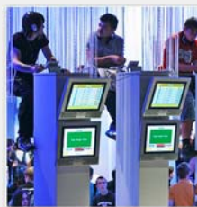
Ready for the biggest gaming convention?

OCZ's Ready for the biggest gaming convention in the world? OCZ is! We're gearing up to support our European customers August 23 to 26 by showcasing both OCZ and PC Power and Cooling booths, complete with setup rig, prizes, and more. More than just a trade show, this will be a truly exciting event, with enthusiasts and gamers competing from all over Europe and the world. The event not only offers gaming competitions, but live outdoor concerts and interactive entertainment, educational presentations, and various workshops.